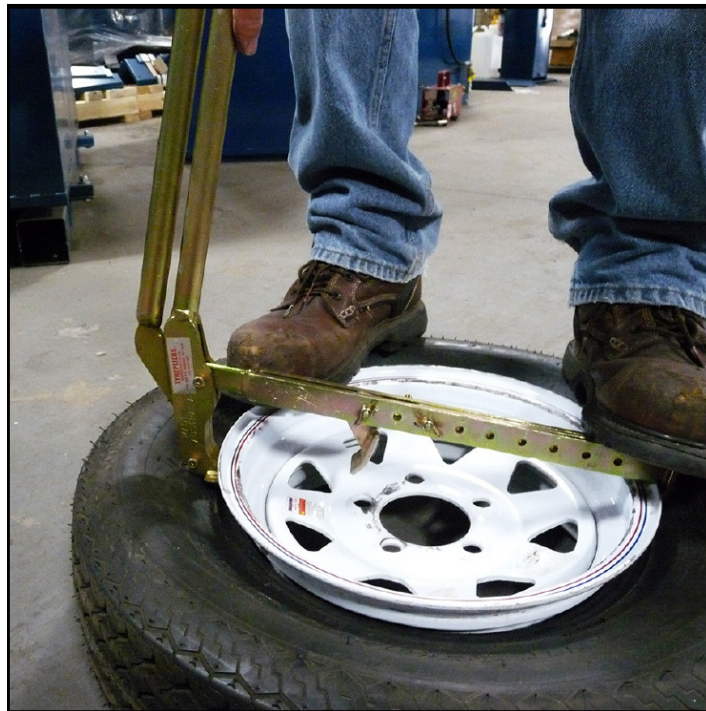
Optional ATV Foot shown