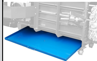
Optional Drip Rail #5954