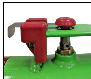
Patented push button automatic discharge with safety trigger cover