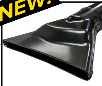
Newly designed barrel greatly increases air volume delivery.